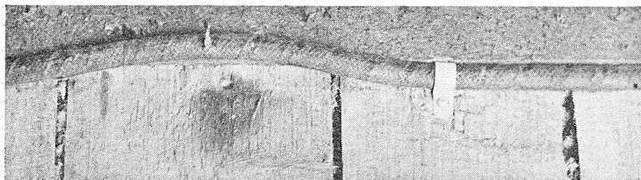
Fig. 1. Deal boards from a stable at a farm in Jutland where unarmoured lead cables were used. The cable is bent aside to show the exit hole of a wood wasp and the burned spot from a short circuit.

a cowhouse. A burned spot about 25 mm in diameter was distinctly seen on one of the deal boards close to the electrical cable. By removing this cable the characteristic exit hole of a wood-wasp appeared (fig. 1). A closer examination of the deal boards showed a great many exit holes varying in size from 4—6 mm's diameter most of them placed in the middle of the 20 mm thick boards (fig. 2). The deal boards were placed in the stable during the summer of 1948. After being kept in a laboratory room for a few days a piece of wood perforated by the insects developed a high degree of convexity probably on account of fresh wood now getting desiccated. By cutting the cable open the insect was shown to have perforated the following sheets of insulation (cfr.