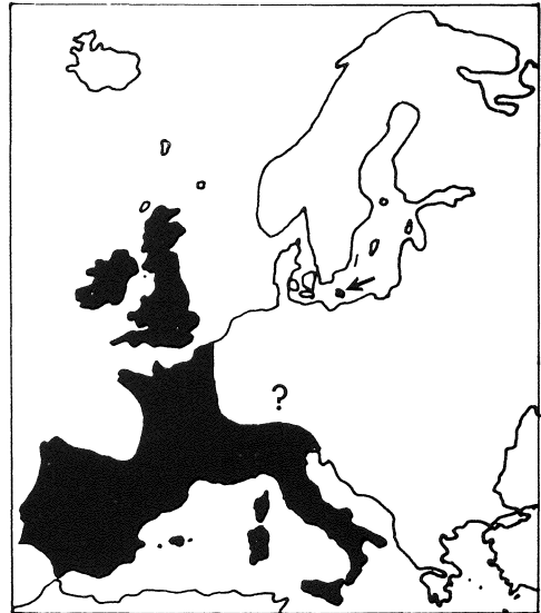
Fig. 2: Approximate distribution of Tinodes maclachlani Kimmins in Europe.