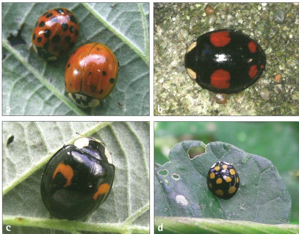
Fig. 2. Colour forms of Harmonia axyridis .

a. Forma succinea, b. Forma spectabilis, c. Forma conspicua, d. Forma axyridis.