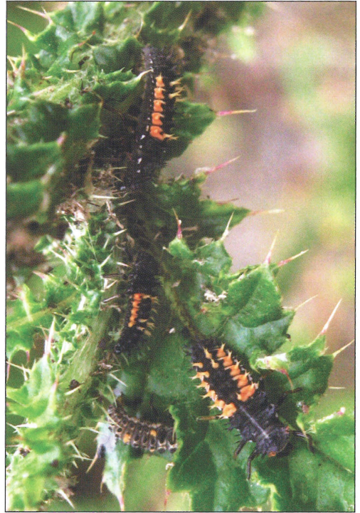
Fig. 4. Larvae of Harmonia axyridis on thistle, July 2008 (Photo: T. Steenberg).

Dispersal rate. Compared to the UK, the dispersal within Denmark appears to have been rather slow. In the UK, the species has on average spread northwards 58 km per year and westwards 144.5 km per year (Brown et al. 2008b). The hotspot discovered in Copenhagen in late autumn 2007 was restricted to the central parts of the city and to adjacent neighbourhoods, with single specimens being reported from outer suburbs. From the center of Copenhagen, where large populations developed in spring 2008, the species has now spread to locations at a distance of up to only 30 km.