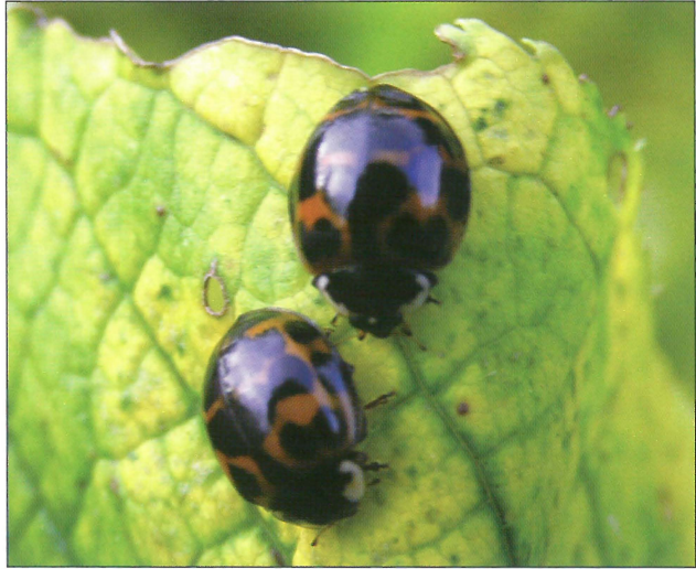
Fig. 5. Harmonia axyridis f. succinea , dark autumn colouration.

woody plants benefited the activity and development. Hundreds of adults and larvae were observed to be active until 19 December. As long as aphids were present H. axyridis fed on available food. Small larvae were encountered in November. Also, pupation took place in late autumn and adults emerging from pupae were observed throughout November. Compared to adults emerging in summer, these individuals were very dark. The dark spots on the elytra of f. succinea were enlarged, frequently merging into large dark areas (Fig. 5), and in the case of the melanic colour forms, the red spots were sometimes hardly discernible. All live pupae observed at the end of November (several thousand specimens) died during winter.