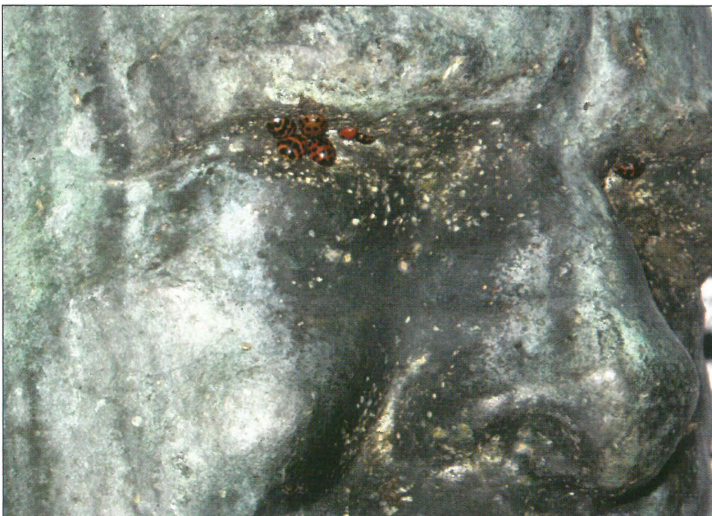
Fig. 6. Aggregation of Harmonia axyridis overwintering on statue, January 2008.

Aggregations of H. axyridis overwintering outdoors were located (in cracks and crevices of tree trunks, on iron fence posts and statues (Fig. 6), in dead leaves at the base of trees) and were observed at intervals throughout the winter. These clusters allowed easy observation of the exact time the ladybirds resumed activity in spring 2008. The first active