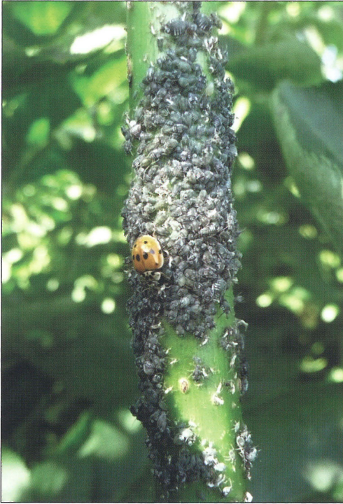
Fig. 3. Adalia decempunctata f. decempunctata. This abundantly occurring colour form of the 10-spotted ladybird is the main cause of misidentification of H. axyridis . A. decempunctata is markedly smaller than H. axyridis (3.5–5mm).