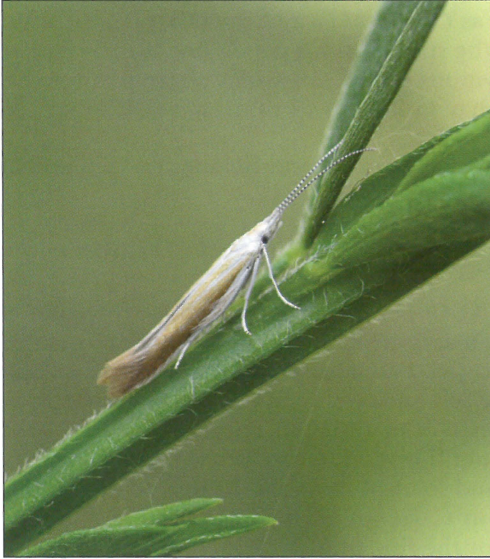
Fig. 9: C. parthenogenella n. sp. resting on Cytisus scoparius .