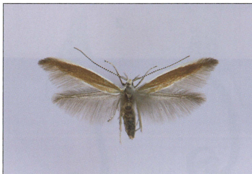
Fig. 8: Coleophora saturatella Stt., female, Denmark, EJ: Hald Ege, la. vi.1987, leg. P. Falck.

and costal streak, ochreous between fold and costal streak becoming yellow ochreous at base and yellow ochreous between fold and white dorsal streak; a rather broad white streak on costa almost to apex; a very indistinct discal streak, frequently obsolete; a narrow streak along fold and one on dorsum; costal fringes white, brownish at apex, dorsal fringes greyish. Hindwing grey, cilia grey. Abdomen grey, last segment with ochreous scales, greyish white below. Hindleg white, tibia with golden ochreous stripe on outer lower edge, tarsal segments dark greyish ringed and spurs white.