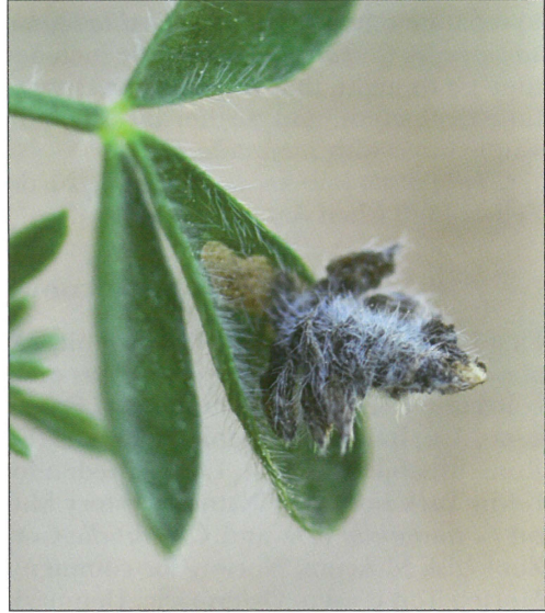
Fig. 10: Case of C. parthenogenella n. sp. on Cytisus scoparius .